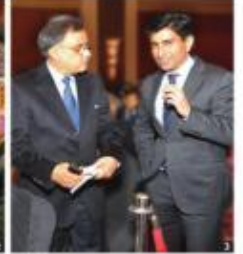
1. Jagdish Bhagwati with Suresh Prabhu, Railway Minister 2. Suresh Prabhu, Minister of International Trade, Nepal 3. (L) Usha Shankar Bhatia and Rahul Puri 4. (L) Suresh Prabhu, Jagdish Bhagwati, Gagan Adani and Suresh Bhatti Mittal